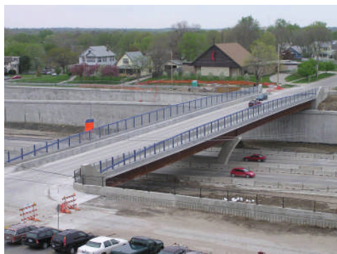
Figure 1. East 12 th Street Bridge as seen from the SHM site camera

By using the SHM system to continuously monitor bridge behavior, at any point in time, the overall condition of the bridge can be evaluated.