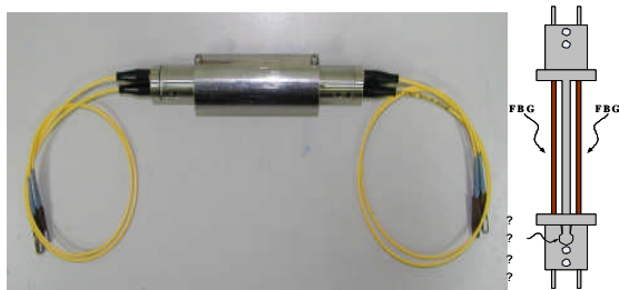
Figure 3. Aspect of POFC's FBG bending sensor

An illustrative example of land movement monitoring applications is the research work being conducted by AVP-Optical Sensing Business Unit and Prime Optical Fiber Corp. in China. Jointly, they have developed a long-gauge bending deformation sensor that employs a discrete array of FBG sensors. Figure 3 is a photo of the basic sensing element. These bending sensor elements can form arrays by attaching them to support tubes and discrete distances as depicted in Fig. 4. In this fashion, it is possible to measure deformation in a quasi-distributed fashion over several 10s of meters.