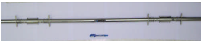
Figure 4. 2m-long bending sensor array

One ideal application for such bending sensor is the monitoring of soil deformation and shifting under a bridge pillar. This project was conducted in China in 2004 and monitors de land movement at depth of 4mts. Tubular sensors were rammed into the soil at an appropriate depth. The sensor array is encased in a steel pipe provided with anchoring wings (Fig. 5a).