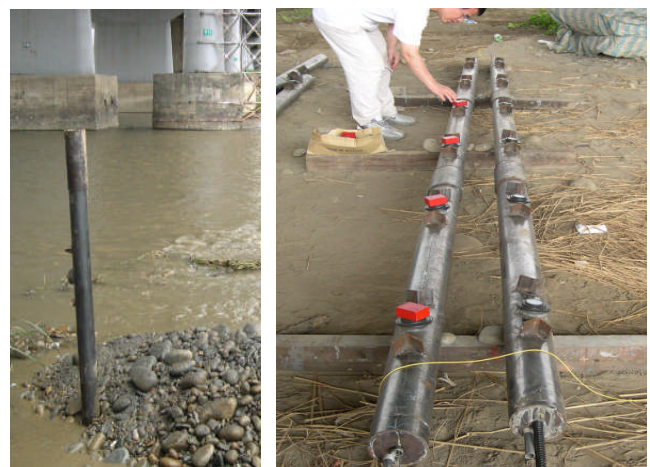
Figure 5. a) 4m-long FBG deformation sensor array inside pipe. b) Deformation sensor installed bridge footing.

Zhou, Z. et al, "Techniques of Advanced FBG Sensors: Fabrication, Demodulation, Encapsulation, and Their Application in the Structural Health Monitoring of Bridges," Pacific Science Review, vol. 5, pp.116-121, 2003.