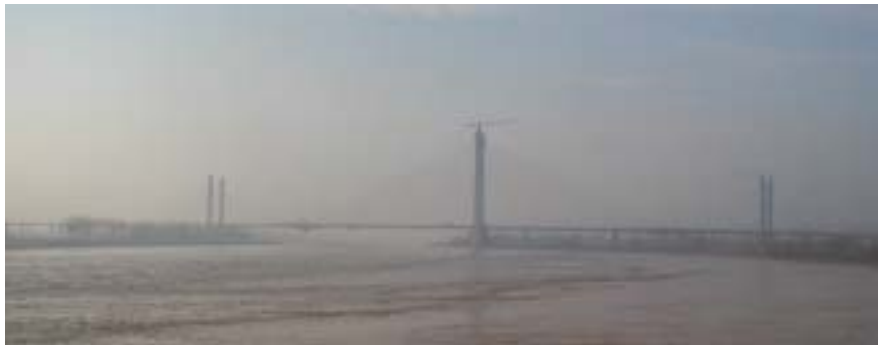
Figure 3. Binzhou Yellow River Bridge in Shandong Province

Ou (2003) has developed several SHM systems based on FBG sensors for several large-span bridges (Figures 3-6) to monitor the performance of the bridges under construction and in service. Clearly, FOS systems can gather detailed information about a span, but making effective use of the data poses somewhat of a challenge.