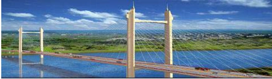
Figure 5. Songhuajiang River Bridge in Heilongjiang Province