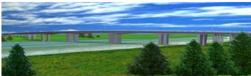
Figure 4. Dongying Yellow River Bridge in Shandong Province

In particular, engineers need to be able to detect and analyze damage at specific locations. This local damage monitoring is paramount. Generally speaking, local damage appears as crack, fatigue, slip, delamination, stiffness loss, effective force-resistance area loss, and so on. Strain is an alternative parameter which can be used to describe deformation, study a crack opening and even detect the slip and bonding, so high-quality strain sensing has always been pursued by the structural researchers.