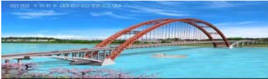
Figure 6. Maocaojie Bridge in Hunan Province