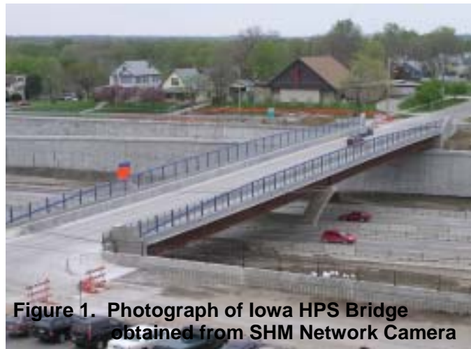
Figure 1. Photograph of Iowa HPS Bridge obtained from SHM Network Camera

In early 2004, the Iowa Department of Transportation (DOT) completed construction of Iowa's first High Performance Steel (HPS) bridge (Figure 1) through the Federal Highway Administration's (FHWA) Innovative Bridge Research and Construction (IBRC) program. When compared with conventional steels, HPS has improved weldability, weathering capabilities, and fracture toughness.