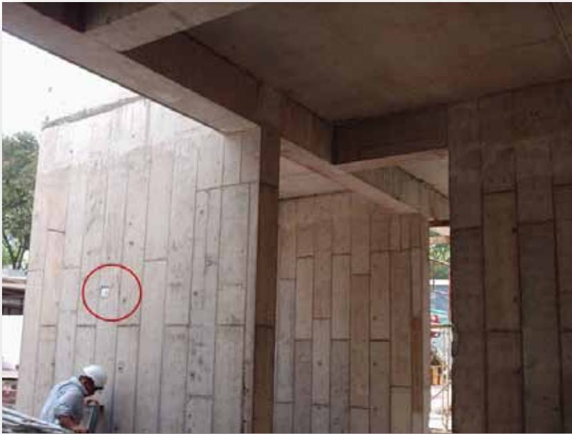
Completed pillar with sensor access panel.