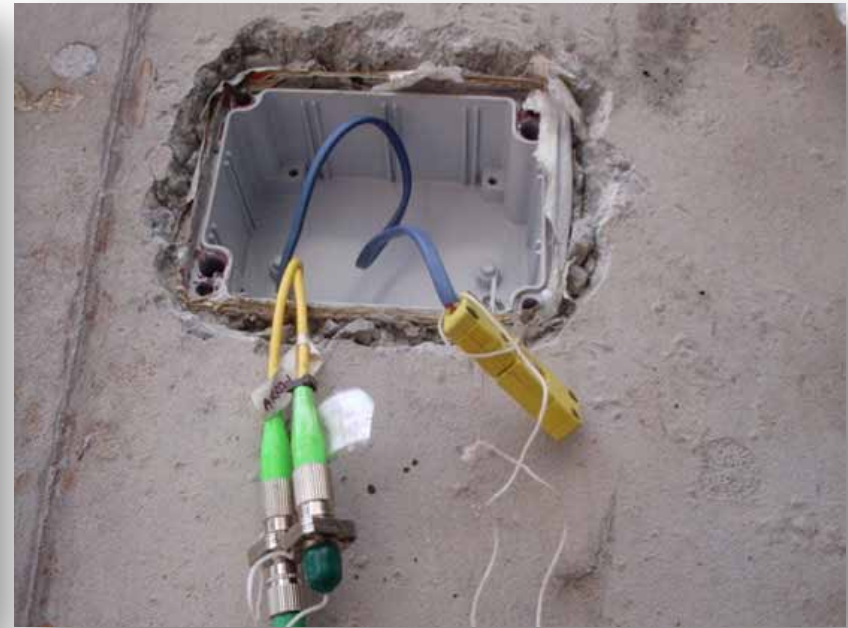
SmartBar Sensor cables exiting pillar.