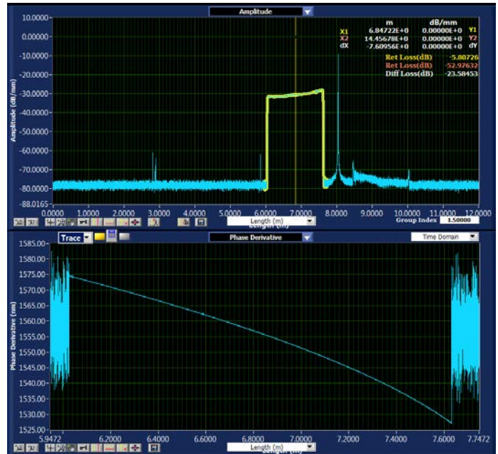
Figure 1: Phase Derivative (Wavelength) of Grating Versus Distance

In addition to the phase derivative information displayed in Figure 1, the user also has the capability of viewing the return loss of the grating as a function of wavelength, as shown in the bottom graph of Figure 2. The user can switch between these views in seconds, using the simple, intuitive user interface of the OBR 4600 product. The data may be saved to files and recalled for further analysis at a later time.